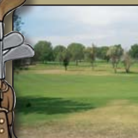
Paradise Valley Country Club 70 Magnolia Street • 307.234.3079

Unique, nine-hole public course. Open from May through mid-October, weather allowing. Pasture golf, designed by employees of local oilfield in the 1920s. Mowed prairie grass fairways and sand greens.