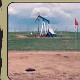
Salt Creek Country Club Highway 387 in Midwest, 307.437.6511

Private non-equity golf course with reciprocal membership. Eighteen-hole regulation length course. Open from April 15 to October 15. Hilly terrain with clear view of mountain. Tight fairways, water on eight holes.