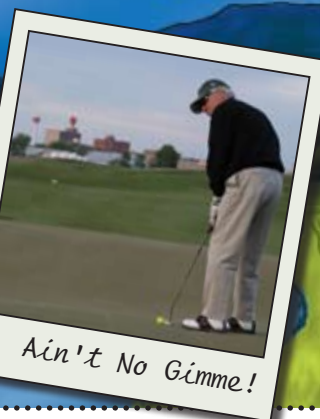
Ain't No Gímme!