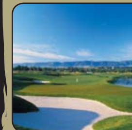
Three Crowns Golf Club 2435 King Blvd • 307.472.5591

Excellent public golf course featuring a total of 27 holes. Open from April 1 to November 1. Tee times available one day in advance through the Pro Shop. Restaurant & lounge open during daylight hours.