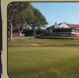
Casper Country Club 4149 E. Country Club • 307.265.0767

Award-winning, 18-hole public course designed by Robert Trent Jones, Jr. Open from April 1 to October 31. Tee times available online or by phone at least seven days in advance. Water features on 14 holes.